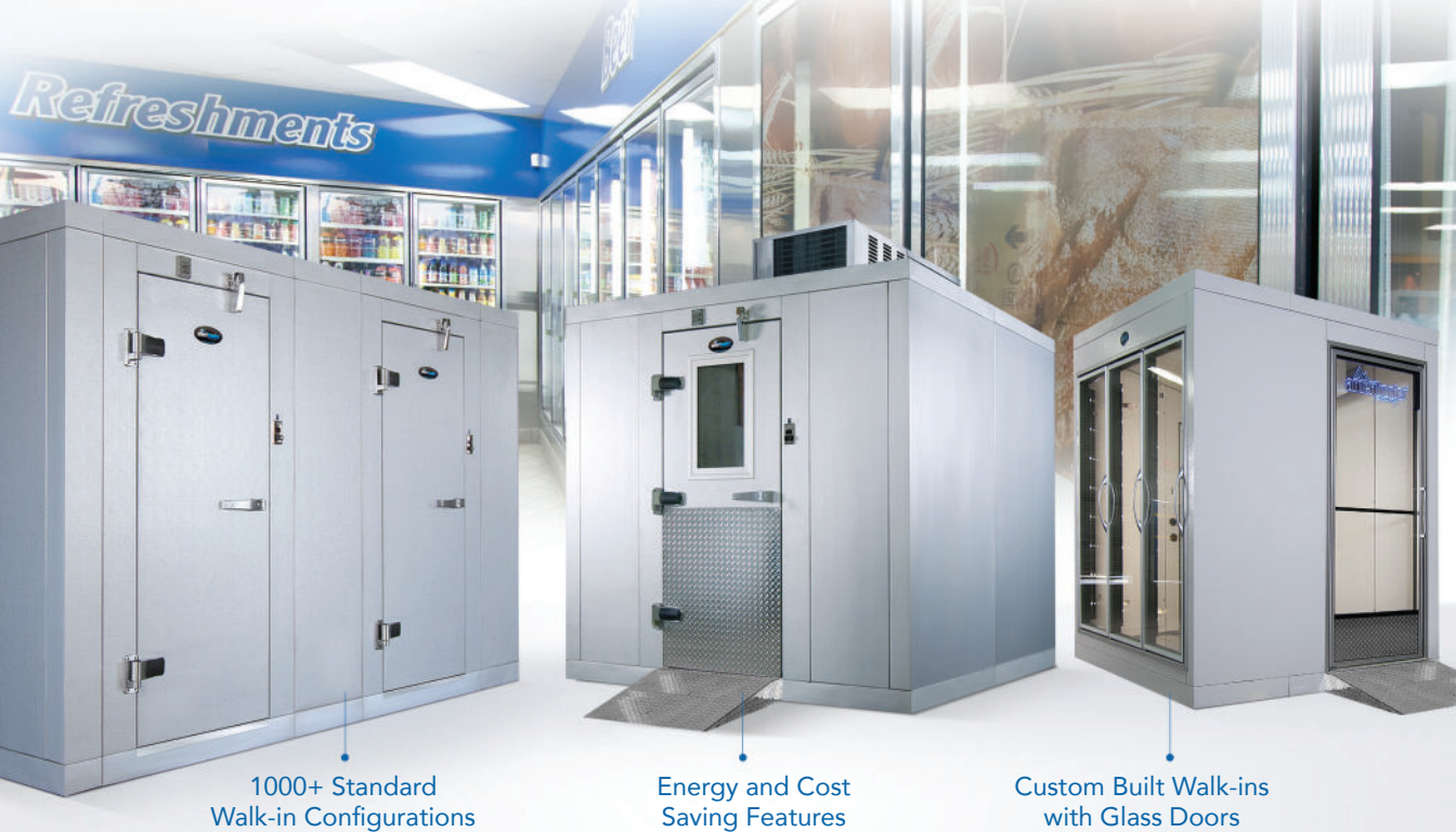
1000+ Standard Walk-in Configurations